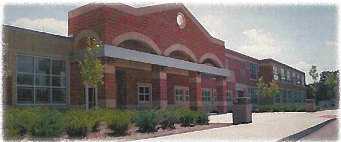
Etna Road Elementary